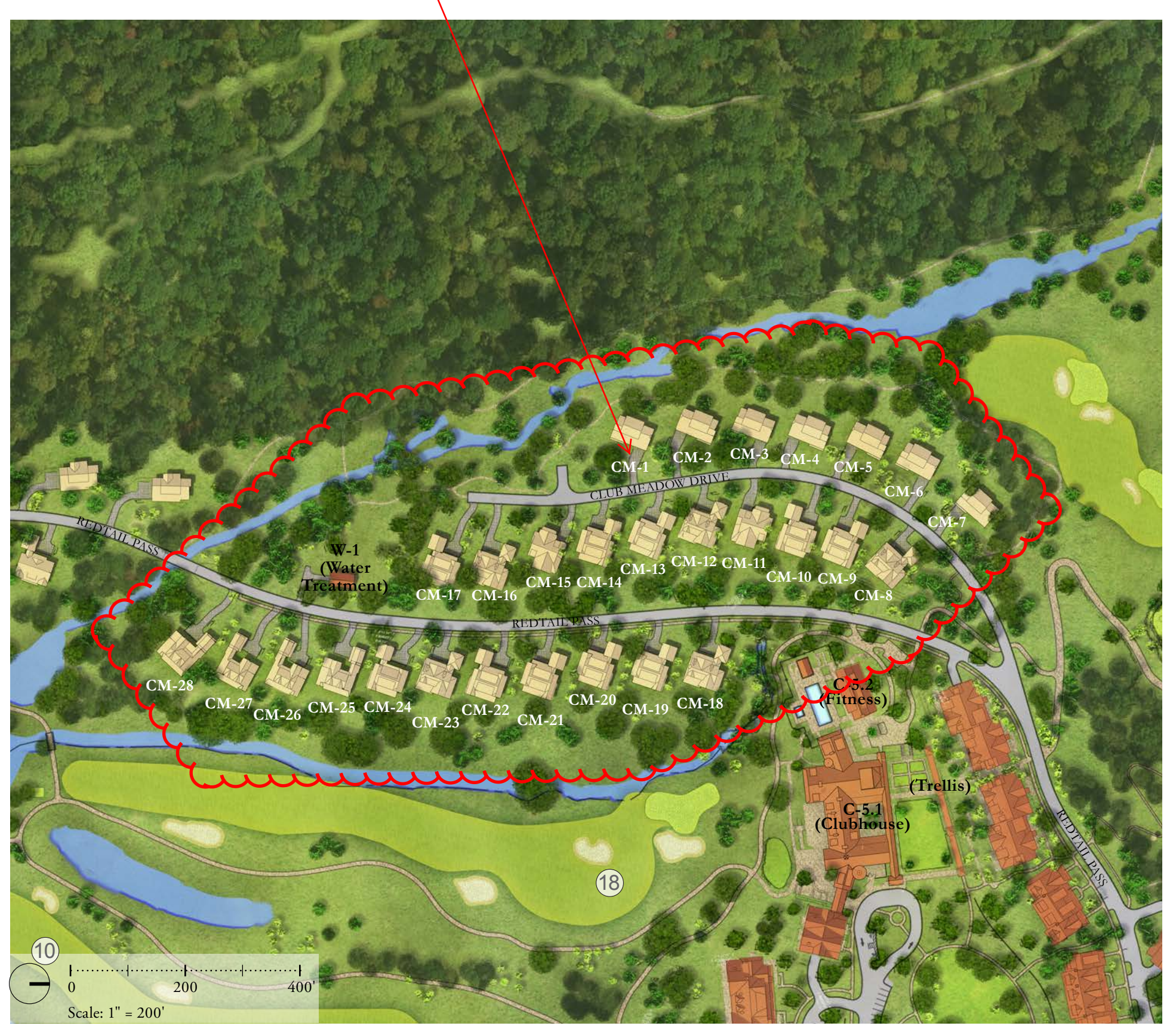
GOLF VILLAS NEIGHBORHOOD